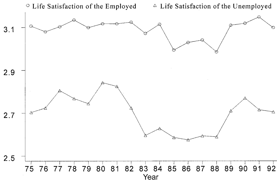
FIGURE 1.—AVERAGE LIFE SATISFACTION OF EMPLOYED AND UNEMPLOYED EUROPEANS

Based on a random sample of 271,224 individuals. The numbers are on a scale where the lowest level of satisfaction is 1 and the highest 4.