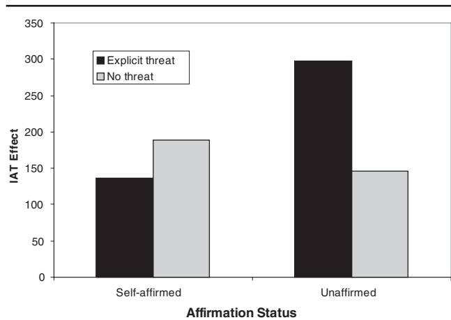
Figure 2 Study 3: IAT effect as response latencies in milliseconds as a function of threat condition and self-affirmation status.

Once again, the assumption of homogeneity of variance of IAT scores was violated. The threatened unaffirmed condition had significantly larger variance ( SD = 291 ) than the other three conditions ( SD = 191 ), F(1, 93) = 5.60, p < .05 . Instead of ANOVAs, a planned contrast, corrected for unequal variance, was conducted. As pre-